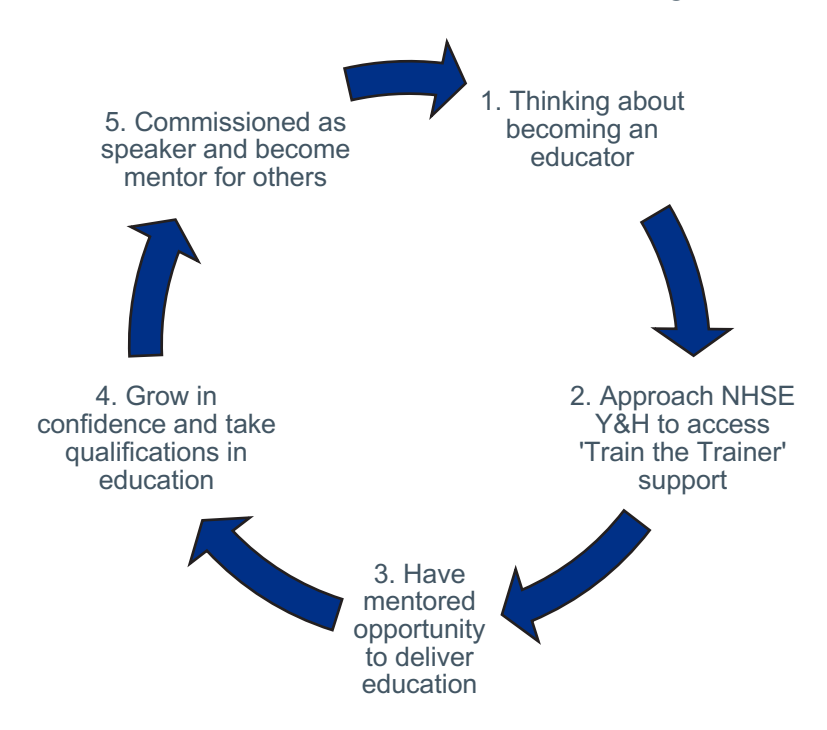
Stage 1 At stage 1 the dental nurse should refer to the 'Educator Pathway' document and consider completing a SWOT analysis to understand who they are, what they want and why they want to become an educator.

This course can also be used to encourage dental nurses to develop in an educator role. The model has been developed by Y&H NHSE Workforce Training & Education DCP team to provide opportunities to access taster sessions in delivering education.